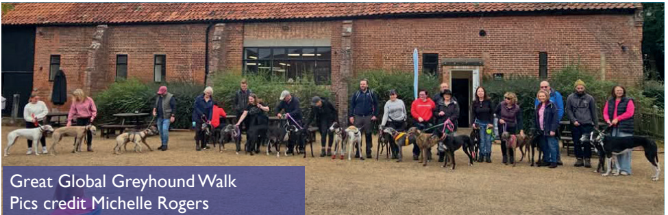
Great Global Greyhound Walk